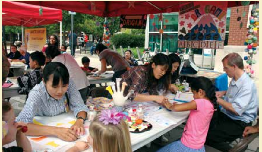
Making finger puppets at Global Fest