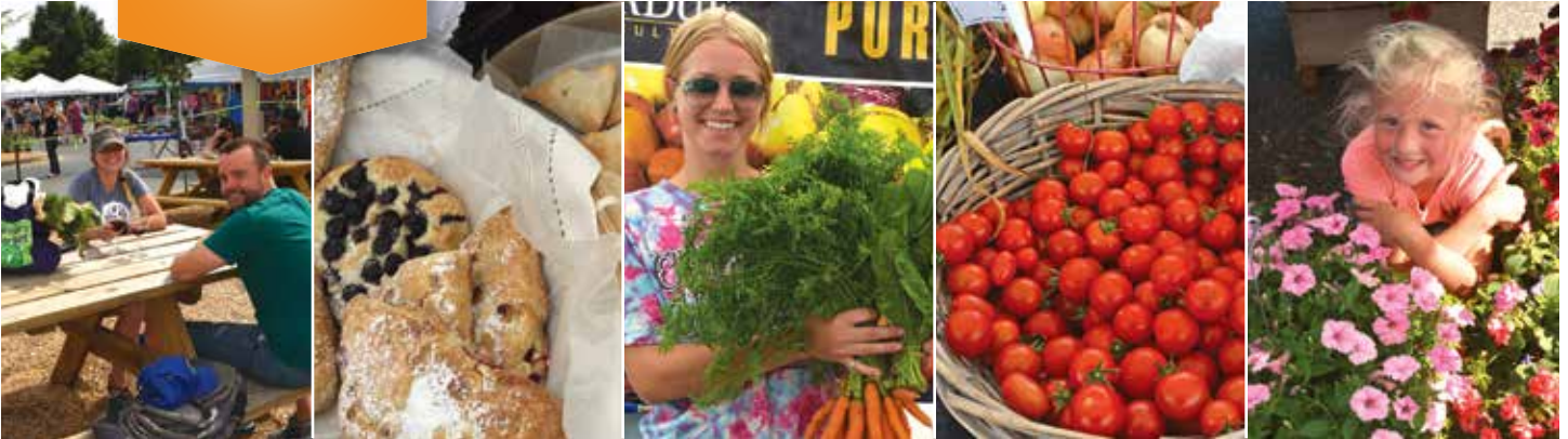
West Lafayette Farmers Market opens May 4