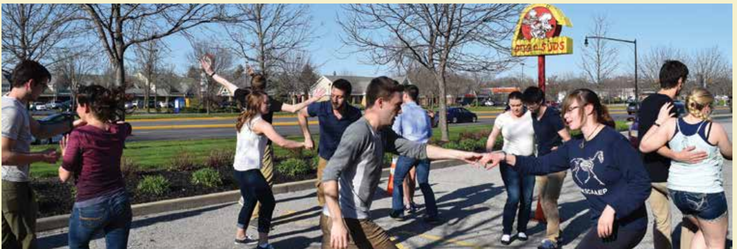
Photos of live art performances by PopArt participants.