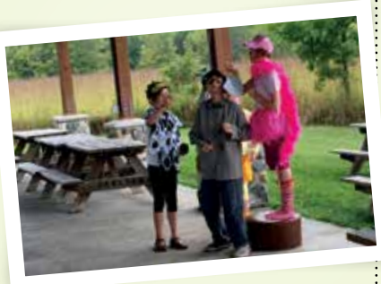
Morton Youth Actors

Saturday | April 8 | 5 – 8 pm Morton Community Center