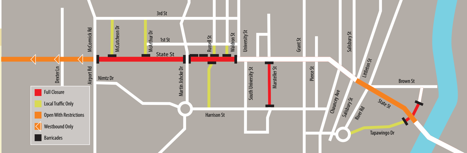
State Street Project Traffic Plan for April 1 – May 14, 2017