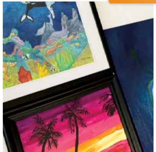
Rehmel Student Art Show

The Public Arts Team is seeking input for a new sculpture to be installed at the Kalberer entrance of Cumberland Park. The park is home to many recreational activities, including a new playground and many soccer fields. What comes to your mind as the embodiment of Cumberland Park? (A sculpture for the Farmers Market will be installed later this year at the Salisbury entrance.) Please send your input to bshaw@wl.in.gov .