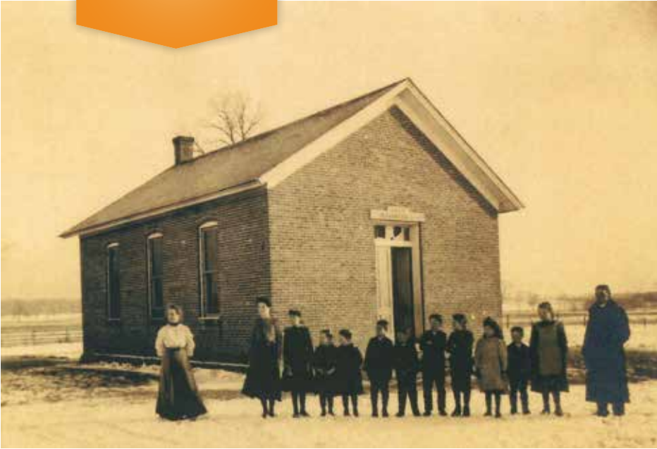
1879 Morris Schoolhouse moving to new Cason Family Park.