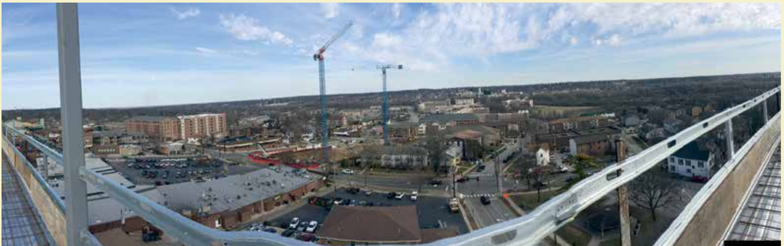
View of the construction of Rise and Hub Plus from on top of HUB. Downtown Lafayette is in the far background.

RISE | 100 S. Chauncey | 16 stories | 289 units 675 beds | 1st-floor commercial | August 2019