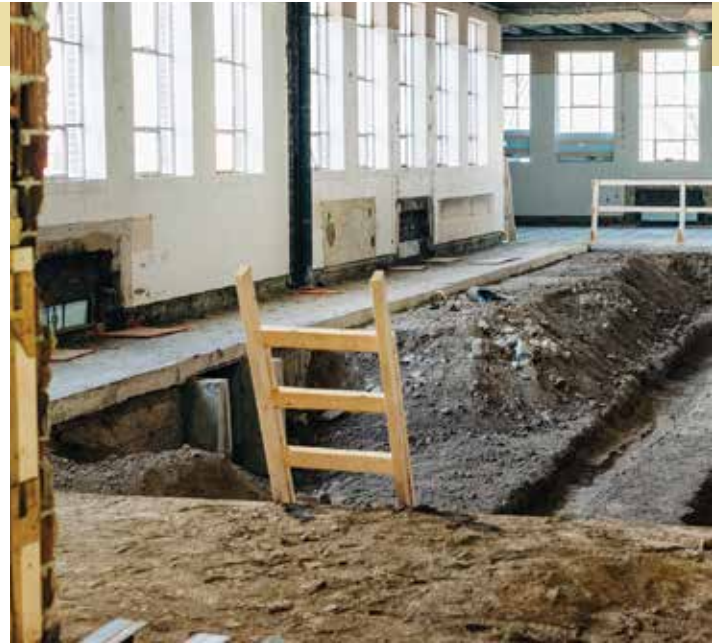
Construction is underway in the Margerum Government and Community Center.