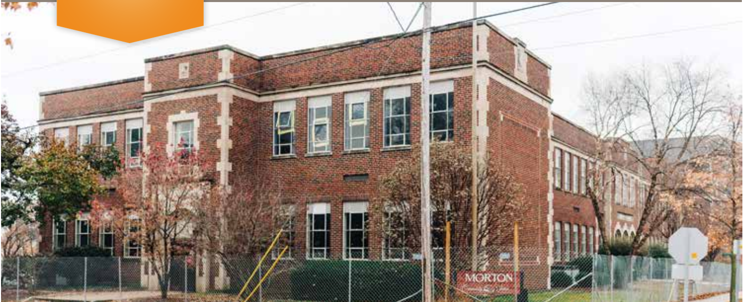
Future Margerum Government and Community Center