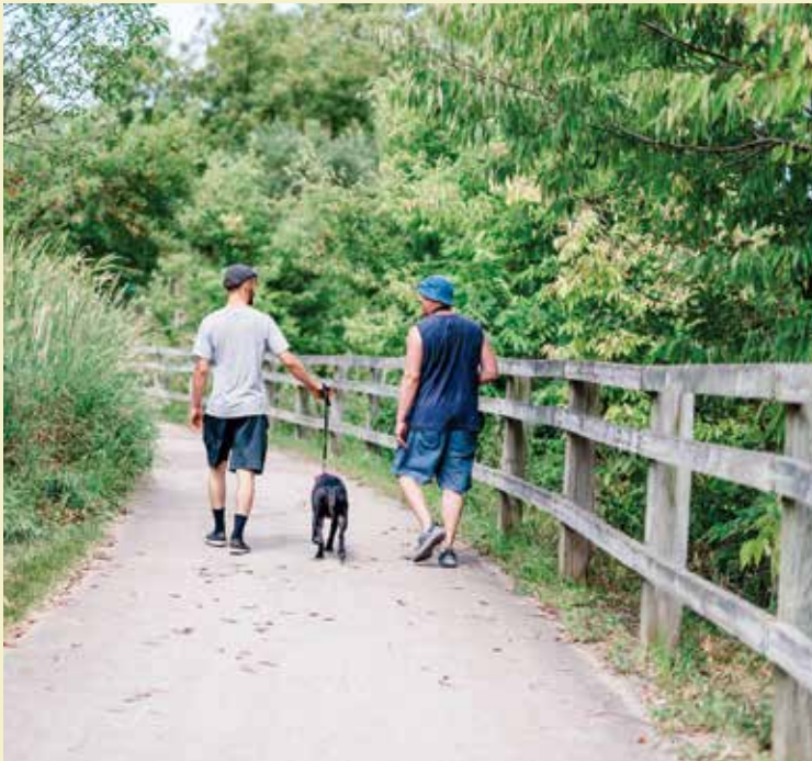
Multimodal connections throughout WL promote safe travel while walking, cycling, and driving.

To view the previous report that shows the impact that planning played over the last five years, please go to the Park's webpage and search the 2017-2021 Parks and Recreation System Master Plan.