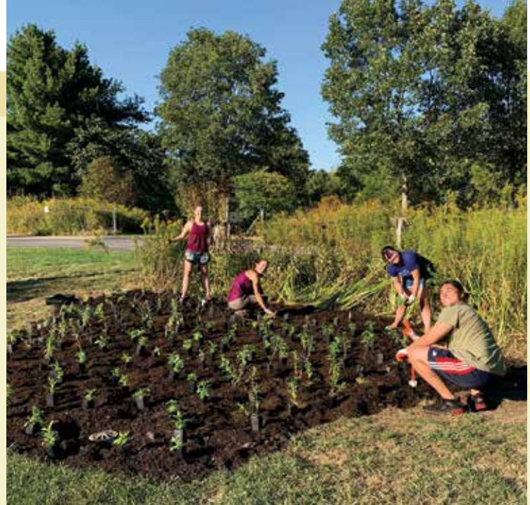
Newly-expanded rain garden at Lilly Nature Center