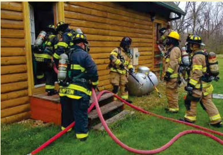
Simulated fire attack training alongside Wabash and Battle Ground firefighters.

Every WL firefighter has completed training through Indiana's Driver/Operator Aerial class, enabling confidence in the safe operation of the department's two aerial devices. In addition, the department received a grant for a training system to educate the community on the proper use of fire extinguishers. Residents are welcome to attend free demonstrations at the West Lafayette Farmers Market on June 16 and October 6.