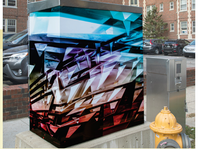
State Street traffic box wrap designed by Al Knight.