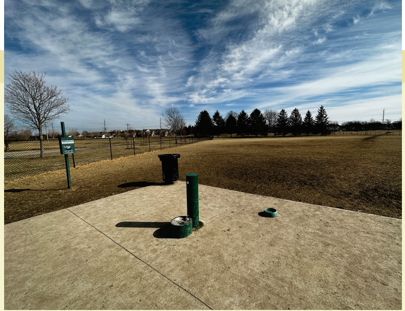
New dog park at Cumberland Park

SAGAMORE TRAIL PROJECT: Construction begins this spring to connect the existing paved Nighthawk Trail at Soldiers Home Road to Sagamore Parkway and the Wabash Heritage Trail.