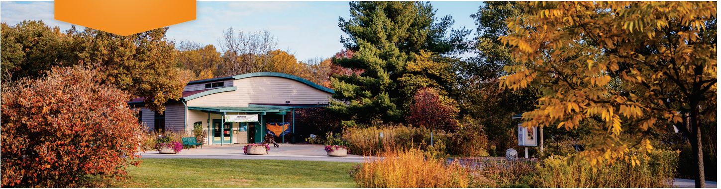
New natural wonders await curious minds at Lilly Nature Center.