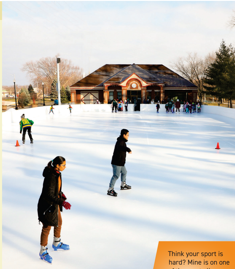
Set along the scenic banks of the Wabash River, the ice-skating rink has been home to kids of all ages since 2002.

Think your sport is hard? Mine is on one of the most slippery surfaces on earth, and I have knives on my feet. unattributed