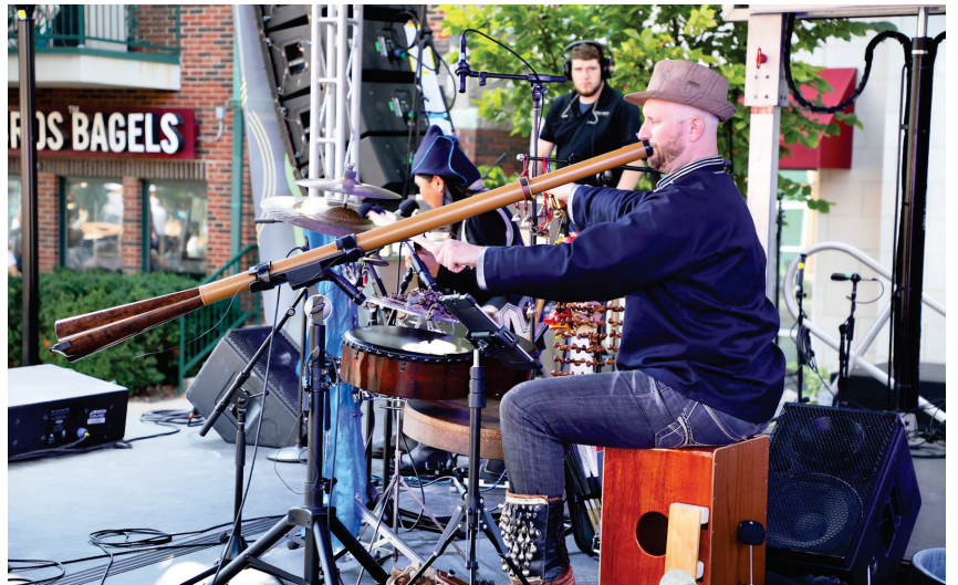
The new Chauncey Plaza was christened at Global Fest.

W hen you are learning how to drive, the trick is to simultaneously keep your eyes on the road ahead, beside, and behind you. But mostly ahead. That's how we doubled our size since 2015 and attracted state-of-the-art businesses here to partner with the expertise and research opportunities of Purdue University while not sacrificing the quality of life, environment, or safety of our legendary college hometown. But at the end of the trip, it's satisfying to see how much ground you've covered. The following recap captures the City's high points from 2022.